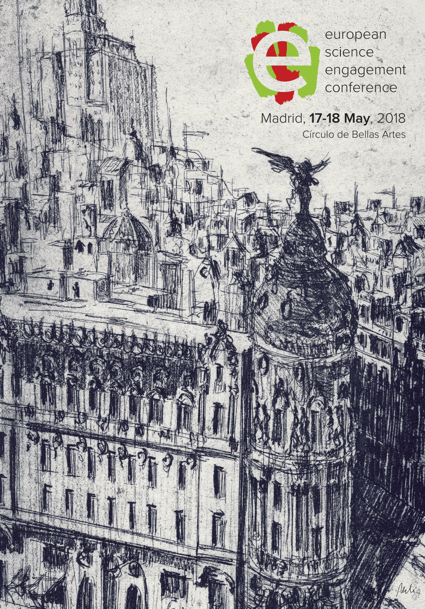
"La Gran Vía" Etching, soft varnish